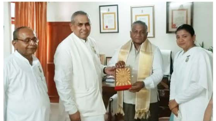
Dr. B.K. Mruthyunjaya giving Godly Gift to Hon'ble General (Retd.) VK Singh Ji, Union Minister of State for Road Transport and Highways.