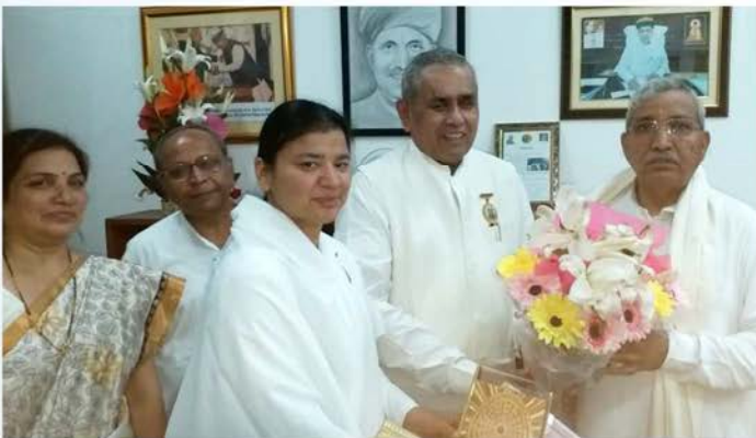
Dr. BK Mruthyunjaya felicitating Hon'ble Shri Arjun Ram Meghwal Ji, Union Minister of State for Water Resources, River Development & Ganga Rejuvenation and Parliamentary Affairs with flowers and Godly gift.

This campaign plans to enable people to become aware of the environmental issues that plague the earth. Also, as a spiritual organisation, our main aim is to help people to experience greater well-being through inner peace and universal values. The Brahma Kumaris will conduct programmes to explore the connection between the consciousness of the individual and the collective effect on the state of the planet. Our consciousness determines the values by which we live. Our values form the basis of our actions which in turn determine whether or not they contribute to the protection and sustainability of the environment. In addition, the campaign aims to plant diverse varieties of saplings with contribution from people in schools and colleges, community groups, businesses and governments. The idea is to get people to participate in educating their neighborhood about benefits of having a clean and green surrounding.