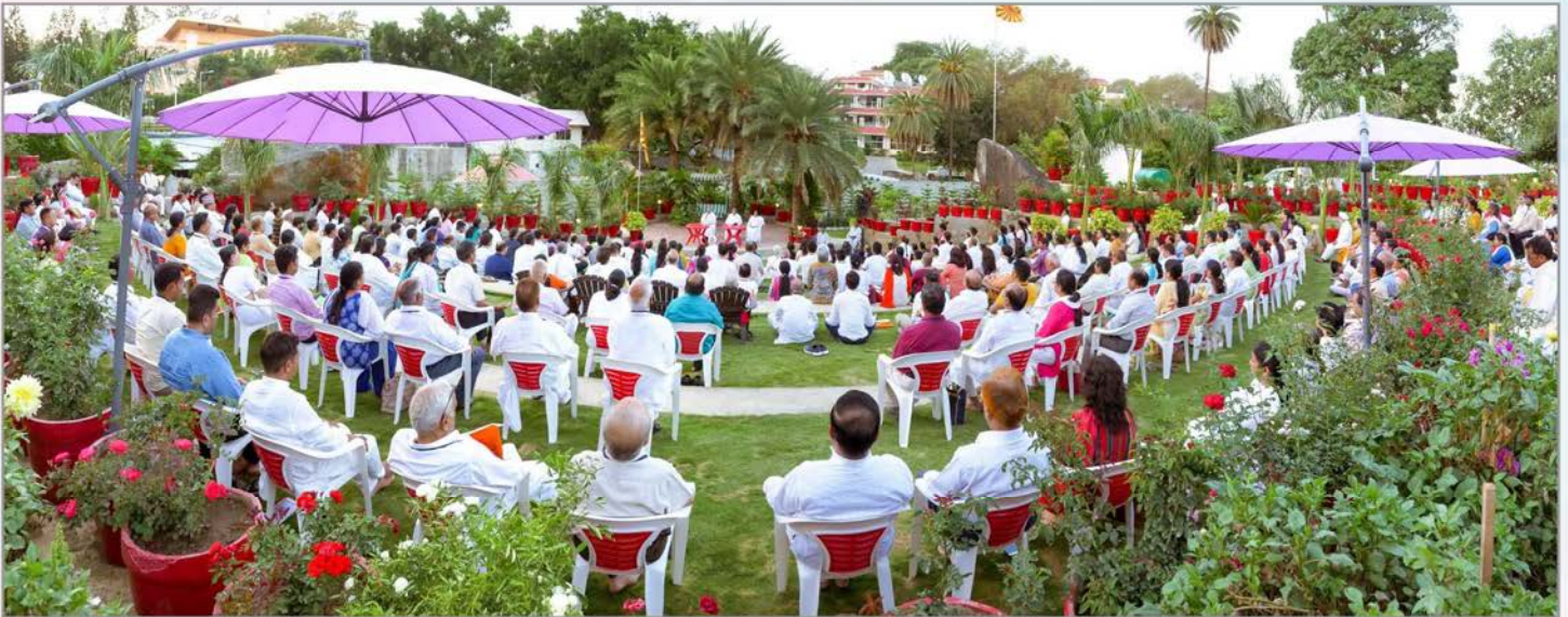
Evening Meditation Programme organised at Dadi Janki Ji Park, Gyan Sarovar, Mount Abu during University & College Educators Conference on "Values and Spirituality for Overcoming Challenges" held from 17th to 21st May, 2019.