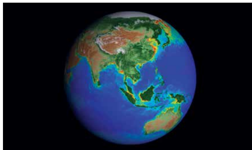
Mother Earth - the only planet in the universe which sustains life.