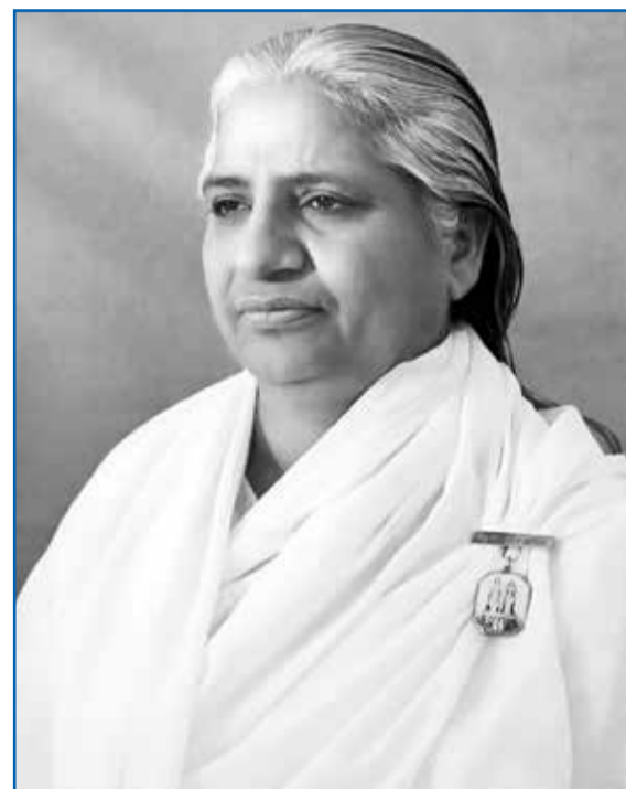
Jewel of Light To Angel of Light