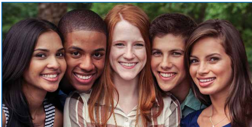
Earth is our only home. Let's make it more liveable for all humans, other creatures, and nature.

we are looking for other inhabitable places in outer space, we have made the only home of mankind that we know of almost uninhabitable.