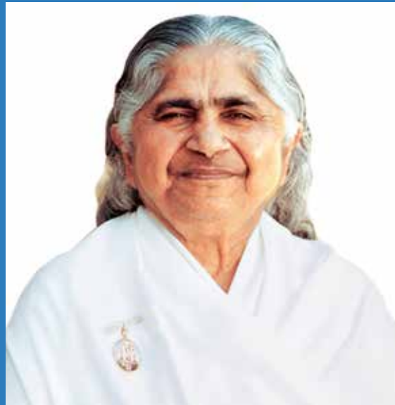
Rajyogini Dadi Janki Chief of Brahma Kumaris