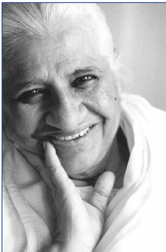
Dadi Prakashmani, former Chief of Brahma Kumaris (1922-2007)

She also brought glory to Rajasthan and to Mount Abu by putting it on the world map. A small hill station in Rajasthan, Mount Abu hosted several value education, peace and harmony conferences and spiritual retreats. The first annual Universal Peace Conference was held there in 1983 and many such events were held regularly later. From VIPs to heads of state and organizations, religious leaders, celebrities, thinkers and opinion makers from all walks of life, all benefited from talks under Dadiji's leadership. At that time, Ahmedabad, the closest big city to Mount Abu, did not even have an international airport. It is quite a miracle how at such a time national and