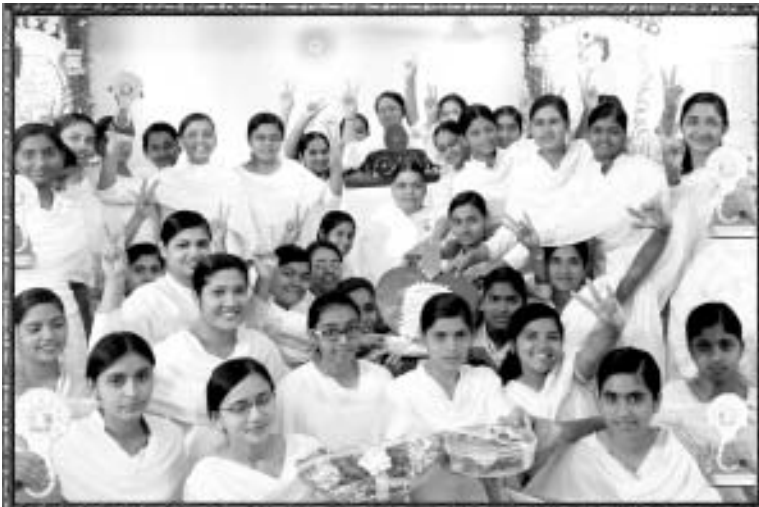
Stars of Success - Indore Hostel Kumaris

This unique hostel, which is one of its own kind, has become centre of attraction. It provides academic facilities from grade VI up to graduation and helps the students excel in studies. At present it boards 150 students and majority of them are from Delhi, Mumbai, Kolkata, U.P, M.P, Assam, Goa, Manipur, Rajasthan, Kerala, Haryana, Himachal Pradesh, Punjab, and also from Nepal. The girls coming from various places and cultures and carrying various natures and traits are trained to inculcate divine and Godly qualities in them and make them walking angels on the earth. The residents here display remarkable cohesiveness and cooperation. Through the regular practice of Godly knowledge and meditation, they're blessed with divine traits, like, truthfulness, honesty, loyalty, punctuality, and develop discipline which is praiseworthy.