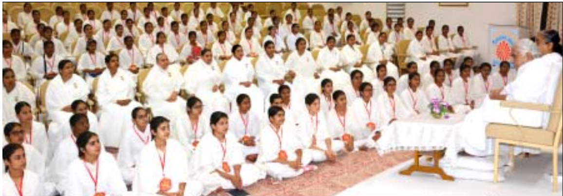
INDORE HOSTEL KUMARIS MEETING WITH DADI JANKIJI

This centre of divine knowledge has groomed and nurtured my three daughters in such a way that I feel to be a proud father to have all three daughters as the crown of my head. I wish every parent avail the opportunity and build the