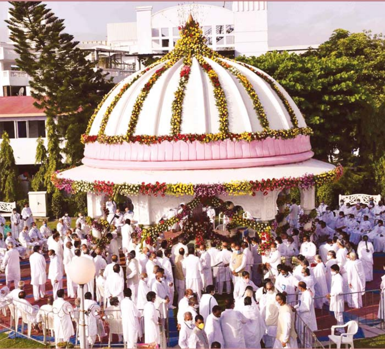
Shantivan: A view of "Prakash Stambh" on 14th Ascension Anniversary of Rajyogini Dadi Prakashmani ji

Vol. 52, Number 6, September, 2021, Price Rs. 8.50, Yearly Subscription Rs. 100/-