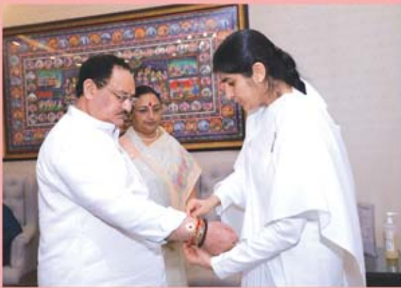
Delhi: Mr. JP Nadda, National President of BJP is being tied Rakhi by BK Shivani.