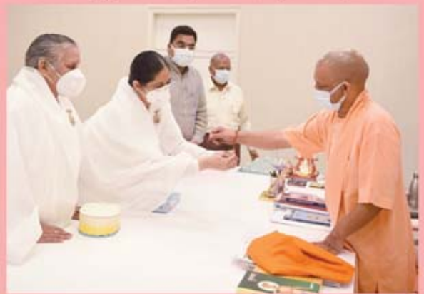
Lucknow: Yogi Adityanath, Hon'ble Chief Minister of UP is being tied Rakhi by BK Radha.