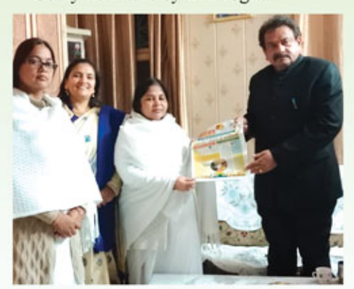
Agra: Mr. SP Singh Baghel, Union Minister of State for Law and Justice is being given Godly gift by BK Madhu.