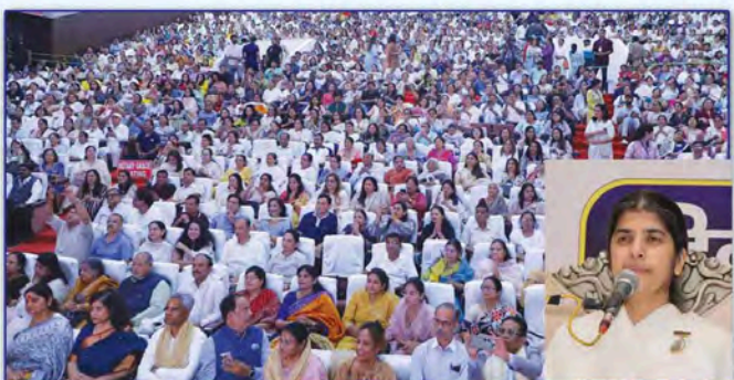
Agra: BK Shivani addressing a programme on 'Designing Your Destiny' organised by Rotary International.