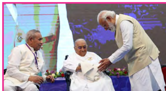
Prime Minister of India Mr. Narendra Modi with Dadi Ratan Mohini