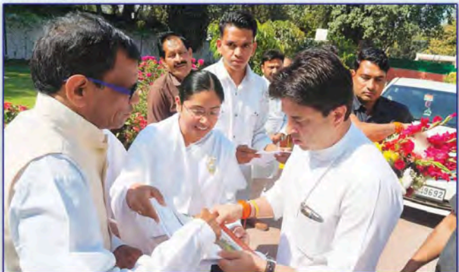
New Delhi: Mr. Jyotiraditya Scindia, Union Minister for Communications is being invited for a media conference by BK Vidhatri and BK Dileep.