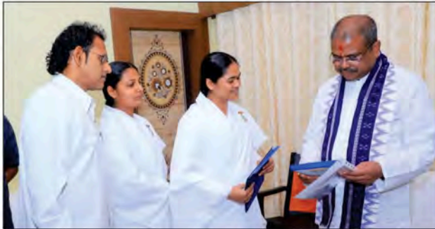
Sambalpur: Union Minister of Education Mr. Dharmendra Pradhan is seen with BK Deepa and BK Krishna during a formal meeting.